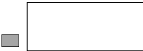
Figure 1. A small and a large rectangle providing a context for mDC

many small units fit into an entire larger unit 3 .